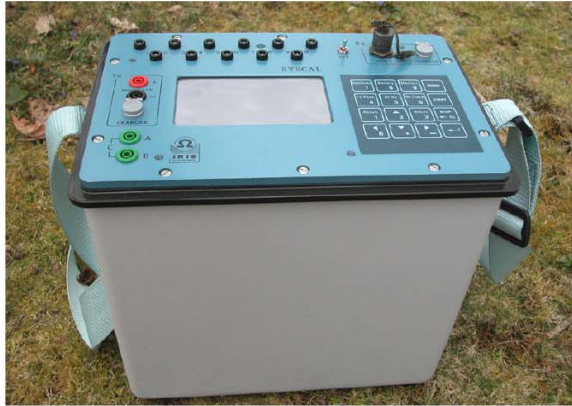
Syscal Pro Unit