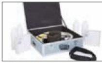
Compact shipping/ storage