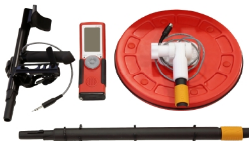
3F-32 Sensor with Telescopic Pole, Control Handle and KT-20 Console