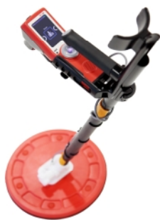
3F-32 Sensor Assembled

Specifications are subject to change without notice (October 18, 2019)