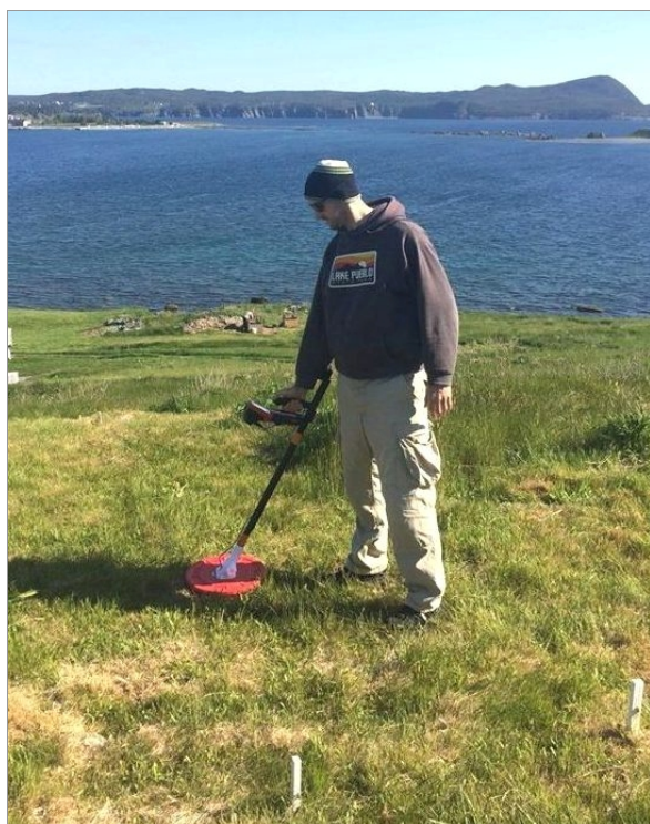
3F-32 Sensor During an Archaeology Investigation in Newfoundland

The KT-20 with 3F-32 sensor is an ideal instrument for field research. It can take a single measurement at a specific location, or continuously collect data to map an entire area. A GPS receiver is integrated into the KT-20 console to provide location coordinates with the data. It also has a built-in high resolution digital camera to visually document any sample of interest. Data from the KT-20 can be exported into third-party mapping software programs.