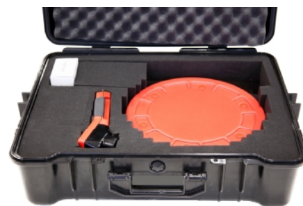
3F-32 Transportation Case