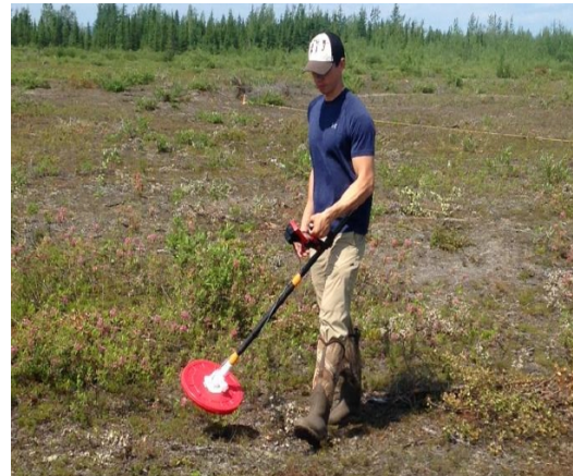
3F-32 Sensor for Soil Mapping

Due to the ability for the KT-20 3F-32 to collect more data, users can create highly precise contour maps using mapping software programs, such as Surfer. External GPS units can be interfaced with KT-20 3F-32 to improve GPS accuracy.