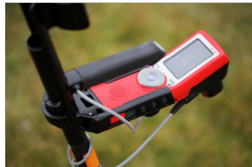
KT-20 Console with 3F-32 Sensor