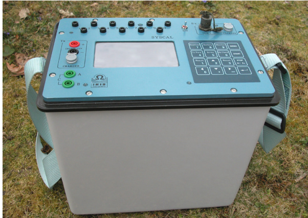
Syscal Pro Unit