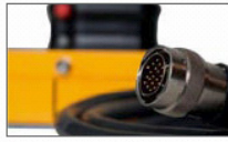
High quality connectors