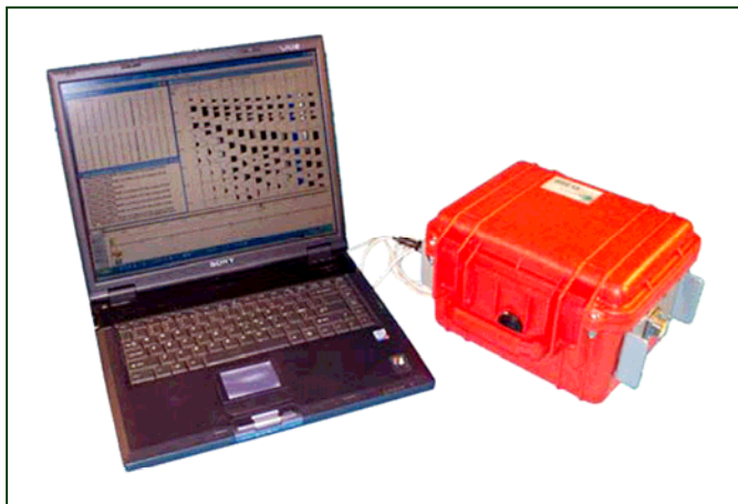
The ES-3000 operates from your laptop loaded with the ESOS data acquisition program.

Looking for a lightweight underground imaging tool but unwilling to spend a bundle? Need an ultra-portable recorder, but don't want to give up on features? Look no further!