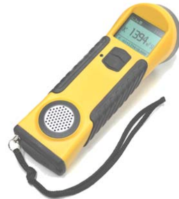
KT-10 v2 Magnetic Susceptibility Meter (Circular Coil)