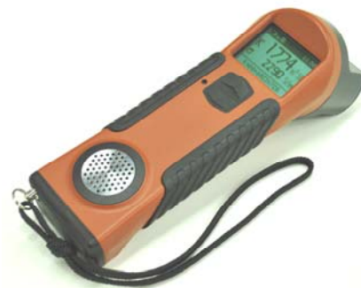
KT-10 S/C Magnetic Susceptibility/Conductivity Meter (Rectangular Coil)