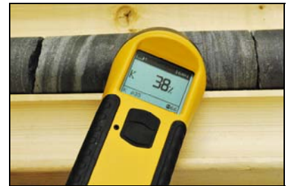
KT-10 Plus v2