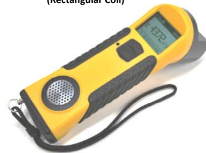
KT-10 v2 (Rectangular Coil)