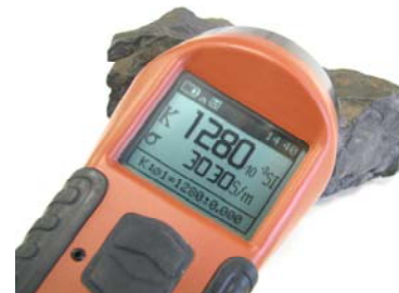
KT-10 S/C (Circular Coil)