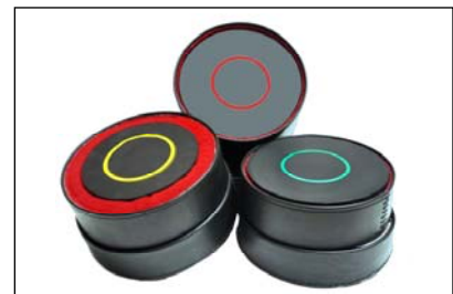
Conductivity Reference Pads