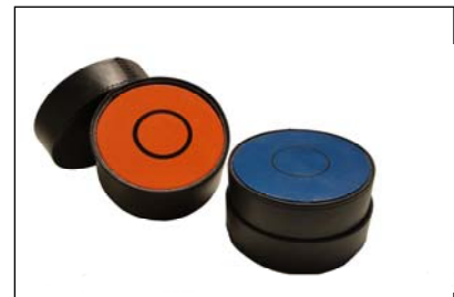
Magnetic Susceptibility Calibration Pads